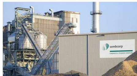
Wilton Location: Middlesbrough, England Customer: SembCorp Utilities (UK) Limited Start-Up Year: 2007 Capacity: 31 MWe Fuel: Short Rotation Coppice (SRC)