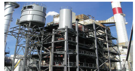
Portucel Viana Location: Viana do Castelo, Portugal Customer: Stora Enso Hytyle AB Start-Up Year: 2006 Capacity: 11 MWe Fuel: Biomass